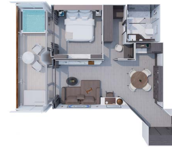
COVE RESIDENCE CO

DECK: 6, 7, 8, 9, 10 - Middle NUMBER OF SUITES: 10 MAXIMUM CAPACITY: 3 adults or 2 adults and 2 children under 18 years old