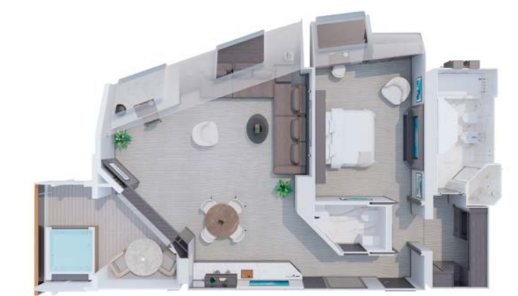
RETREAT RESIDENCE RR

DECK: 7, 8, 9 - Forward NUMBER OF SUITES: 6 MAXIMUM CAPACITY: 3 adults or 2 adults and 2 children under 18 years old